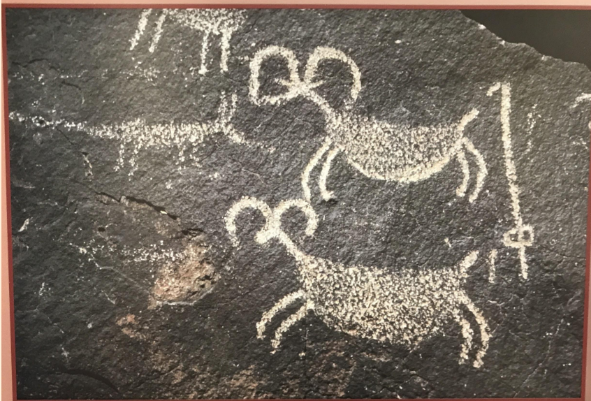
Cosa Range petroglyph with atlatl and Bighorn sheep

https://docs.google.com/presentation/d/1-C7NKQxUhdjH3a1przDTow7e2cP9Z-DGb1li4KMyZ54/edit